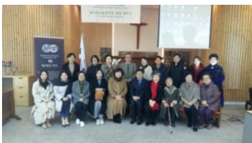
FAS Prevention Seminar Nov.26, 2019,